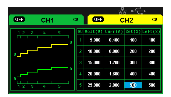
Panel timing output

Through front panel operation, 5 groups of timing settings and output control can be displayed, which provides users a simple power programming function. Also a connection can be made with Siglent's EasyPower PC software providing a full range of communication and control requirements.