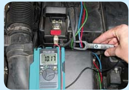
Servicing a car