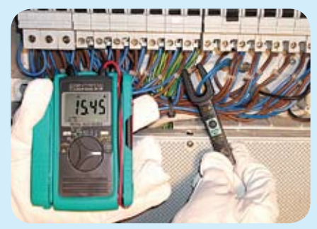
Measuring current in a Switchboard