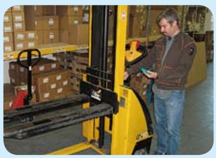
Servicing a Forklift