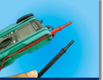
One test probe can be fixed to the meter to help get the job done safer and faster.